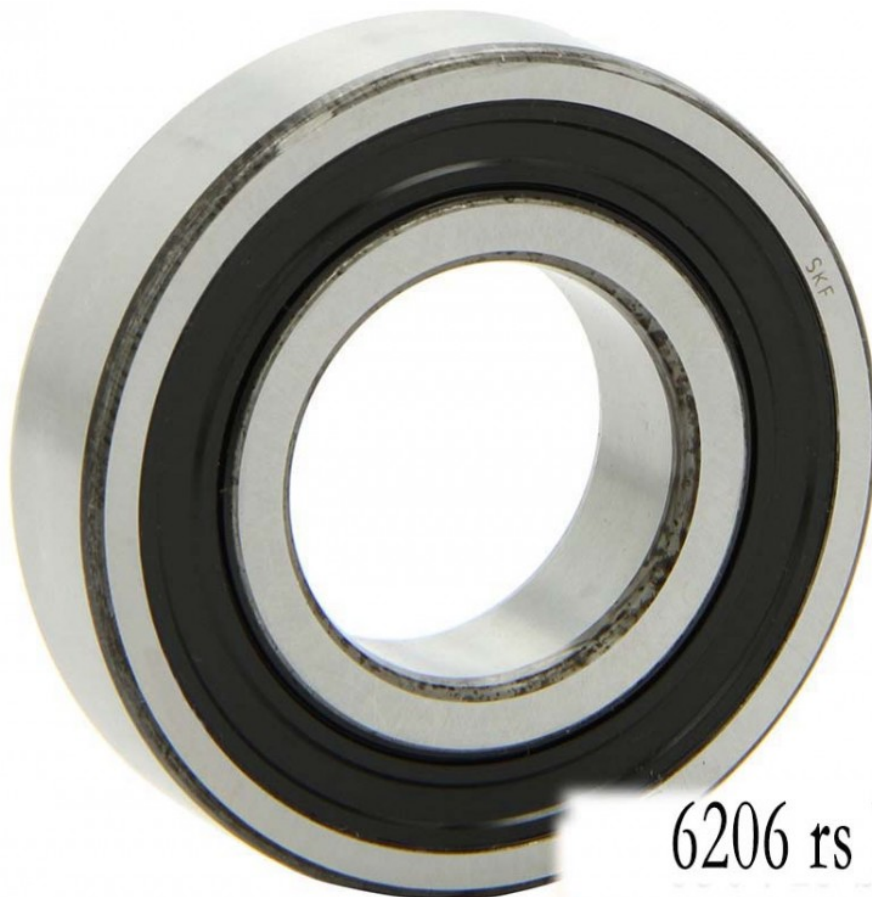
6206 rs bearing

Throughout this exploration, we will uncover the transformative milestones and innovations that have shaped the evolution of 6206RS 30x62x16 Sealed Ball Bearings, their journey from conventional components to indispensable assets in modern mechanical engineering.